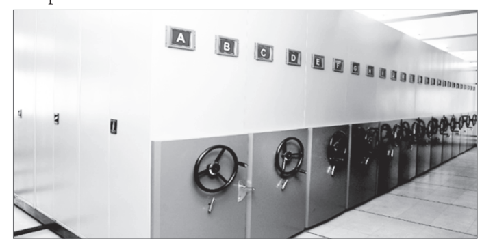
Mobile Racking System for Document Storage

Amul Dairy has started digitalization throughout the entire document storage systems. Earlier Amul Dairy used the conventional static racking, which consumed time and energy. Documents are now stored in mobile racking system and controlled through software for ease of operation.