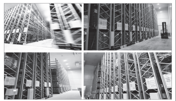
Mobile Racking System at Kheda Satellite Dairy, Khatraj

An integrated, fully automated mobile racking system, the complete fully loaded rack having weight of 378 MT Cheddar Cheese is moving on rails and provides an array of benefits, including: Increased floor-space utilization, 100% selectivity of pallets i.e. direct access to each pallet, Reduced staff costs, Increased handling capacity, Optimized logistics and Enhanced efficiency. For safety and ease of handling of pallets, we are using reach truck as material handling equipment which can handle the pallets at height of 11.2 mtr with 100% selectivity. Amul Dairy also implemented these solutions for other products like Butter, Powder, chocolates and RUTF product later.