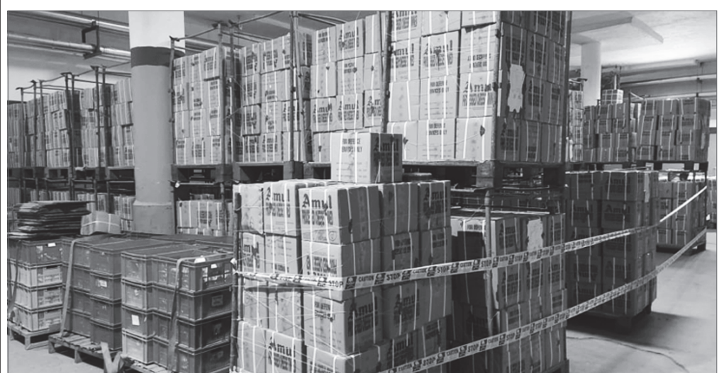
In Earlier Era, Convention Godown at Kheda Satellite Dairy, Khatraj

structure having PUF insulation. The height of building is 14 mtr and racking system was designed for total 3800 pallets position in G+5 level pattern in controlled atmosphere. With help of this system, we can store around 3648 MT of Cheddar Cheese within available area of 1122 sq. mtr. Now we can store 3 times more Cheddar Cheese