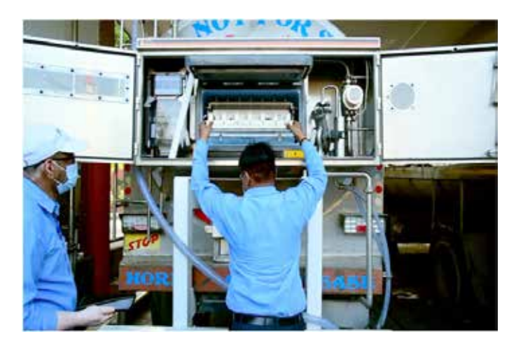
Upgraded Automatic Milk Sampling Unit (Second stage)