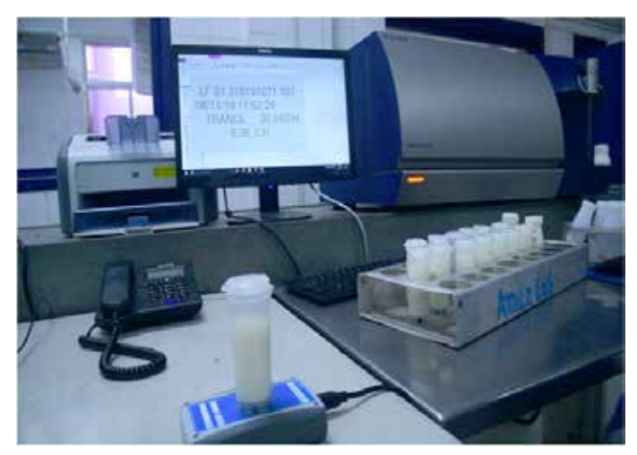
Imported Automatic Milk Sampling Unit (Initial stage)

The device is also fitted with an inline filter, air eliminator& non-return valve. It also has an inbuilt tablet device with a digital display to record & display the real-time data of milk collected from a single VDCS/BMC, all VDCS pertaining to route & total milk collected from a particular route. Data of milk temperatures & milk collected on the previous day are also recorded & displayed. All data collected using tablet devices are fetched to the central server.